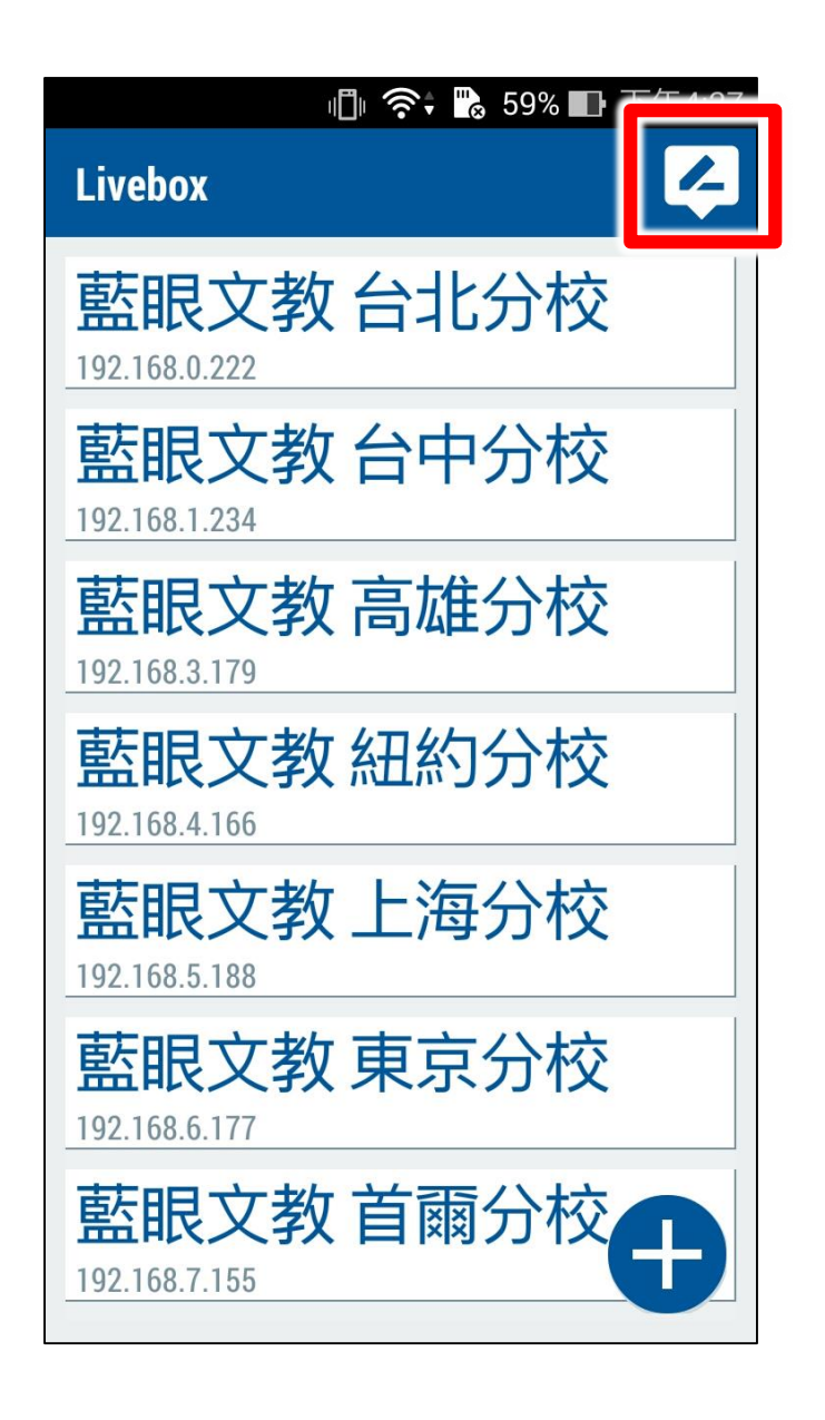
Step 2: click to modify Livebox.